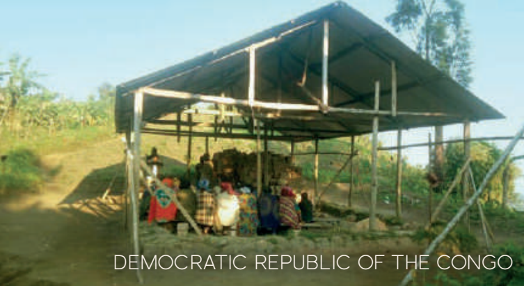
DEMOCRATIC REPUBLIC OF THE CONGO