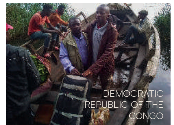
DEMOCRATIC REPUBLIC OF THE CONGO